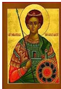
Holy, Glorious Dhimitri October 26