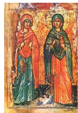
Martyr Anastasia the Roman October 29