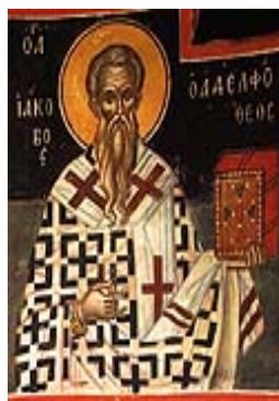
Apostle James, the Brother of the Lord October 23