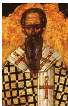
Hieromartyr Dionysius October 03