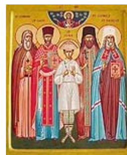
New Martyrs of Alaska, Hieromonk Juvenaly & Peter the Aleut