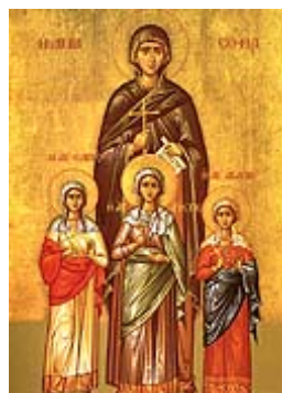
Martyr Sophia and Her Daughters Faith, Hope and Love