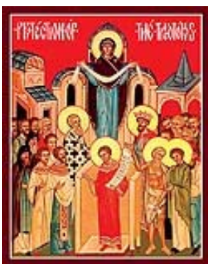
Protection of the Theotokos