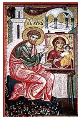
Apostle and Evangelist Luke