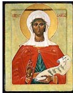
March 19 Martyr Daria and those with her at Rome