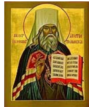
March 31 Repose of St Innocent the Enlightener of the Aleuts and Apostle to the Americas