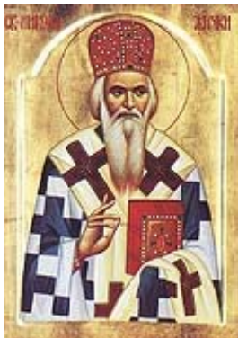
March 18 Repose of St Nicholas of Zichka