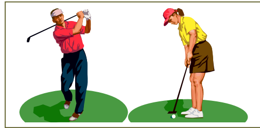
A Great Time was had by all.

The Golf Outing is of course a very important fund raiser for our Church which takes a lot of effort and hopefully next year we will have a new crew in making sure this is a success again. Besides the arrangements for the golf game itself, we have Tee