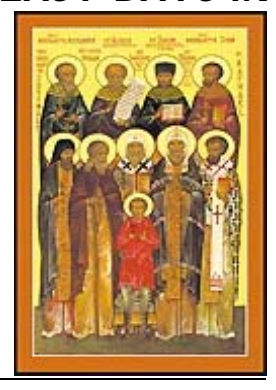
Synaxis of the Saints of North America June 26