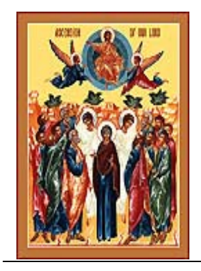
The Ascension of Our Lord June 02