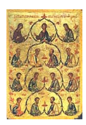
Synaxis of the All-Praised 12 Apostles June 30