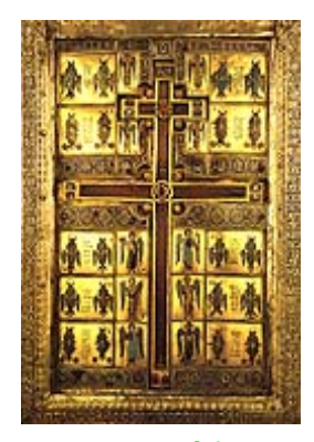
Procession of the Cross August 01