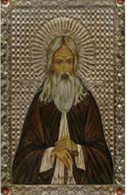
The Venerable St. Herman of Alaska December 13