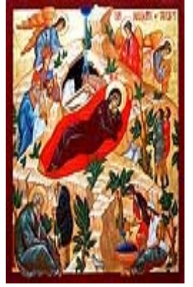
Nativity of Our Lord and Savior Jesus Christ December 25