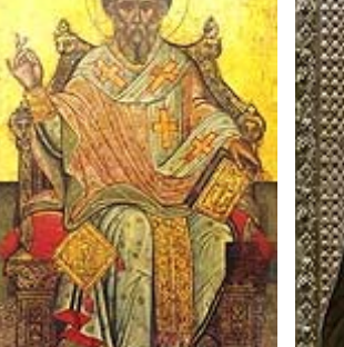
Saint Spyridon The Wonderworker December 12