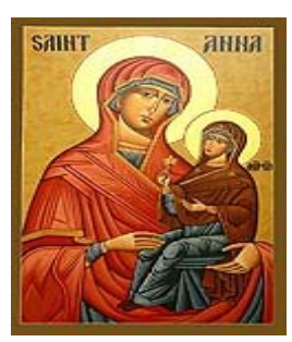
Holy, Righteous Ancestor of God, Anna September 09