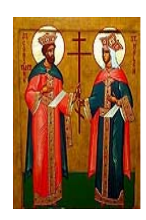
Sts. Constantine and Helen May 21