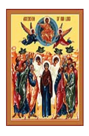
Feast of the Ascension of the Lord May 13